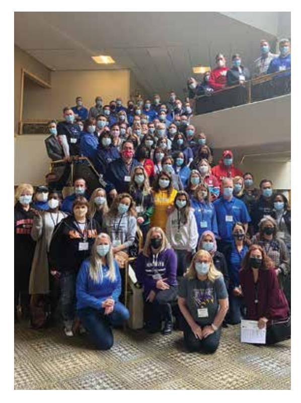
In March, we brought together our Provincial Council, Local Leaders and District EDI reps for a multi-day hybrid meeting.